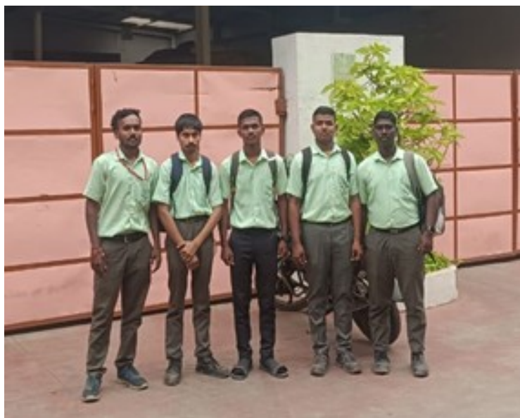
5 Students from Kalwa ITI upskilled at AMTEC got selected at Parasrampur Engineers Pvt. Ltd. (PEPL),

We are pleased to announce that we sent five students for interviews at PEPL, and we are excited to share that all of our candidates have been selected.